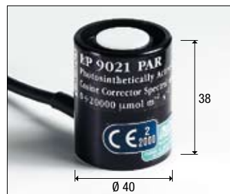
LP 9021 PAR: Radiometric probe for measuring IRRADIANCE in the region of PAR radiations (Photosynthetically Active Radiation); it works in the field of the chlorophyll process following a special response curve.