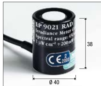
LP 9021 RAD: Radiometric probe for measuring the IRRADIANCE of artificial light sources, irradiance of the sun.