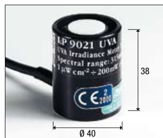
LP 9021 UVA: Radiometric probe for measuring IRRADIANCE in the ultraviolet field. Suitable for measuring radiation in the ultraviolet region A .