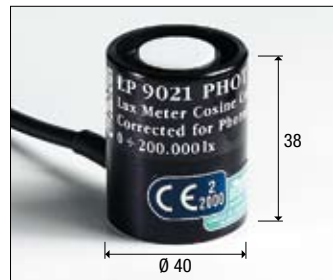
LP 9021 PHOT: Photometric probe for measuring light, ILLUMINANCE , photopic filter complying with CIE, diffuser for correction according to the cosine law.

The instrument DO 9721 has two circular DIN 45326 8-pole connectors (A and B) which allow the connection of Delta Ohm probes for measuring temperature, type TP 870, and probes for measuring the photometric and radiometric intensity, type LP 9021. The probe model should be chosen according to the specific application; see the section on accessories.